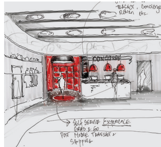
Retail Design & Development