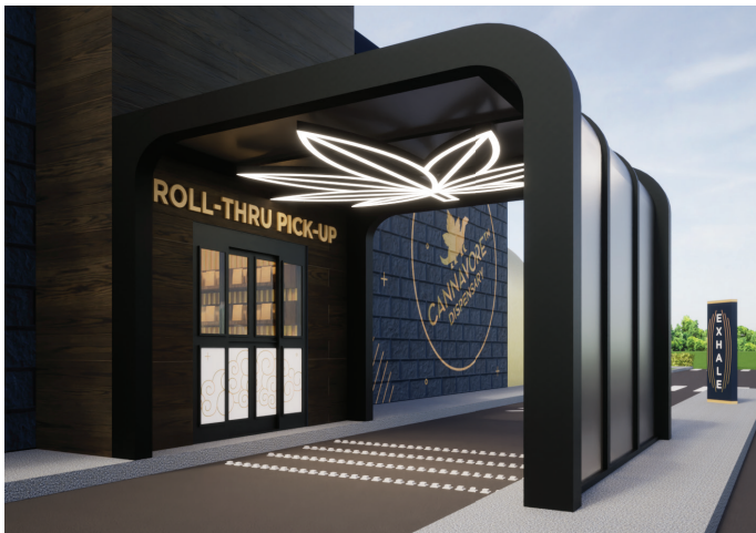
EXPERIENTIAL DRIVE THRU