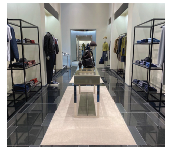
Shop-in-Shop & Fixtures