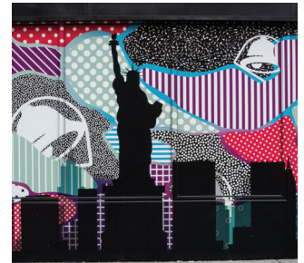
Large Format Printing