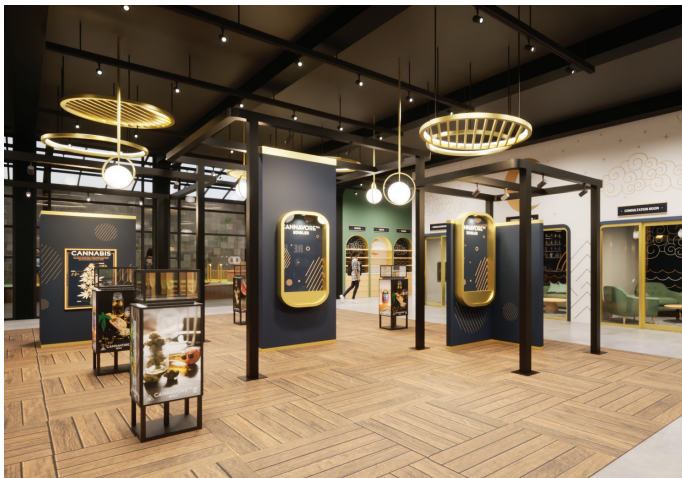
SELF-EXPLORATION MIXED WITH EDUCATION/CONSULTATION ZONES