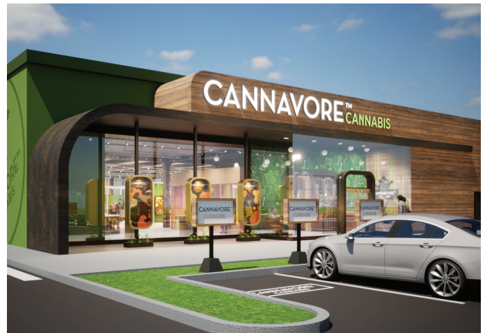
FUNCTIONAL CURBSIDE PICKUP, ENCOURAGING CUSTOMER TO COME INSIDE NEXT TIME