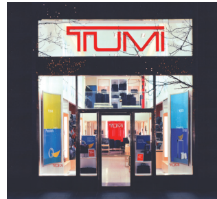
Storefront & Exterior