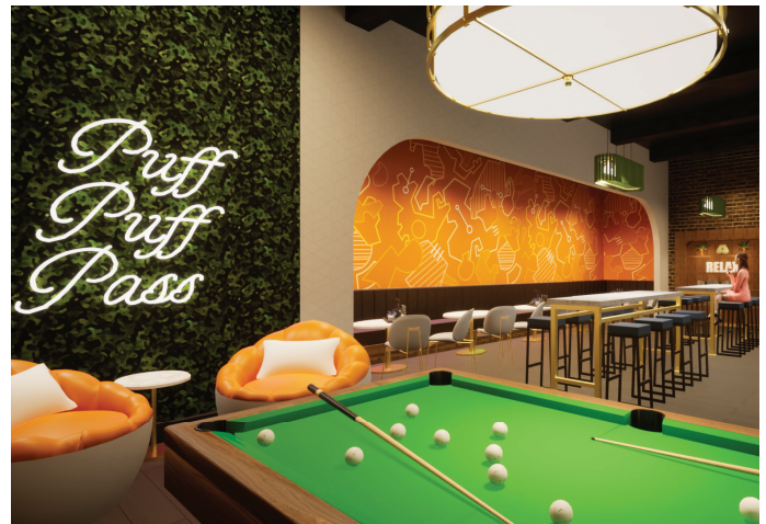
CONSUMPTION LOUNGE FOR BRAND IMMERSION