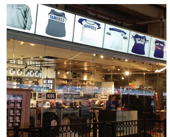
Digital & Technology