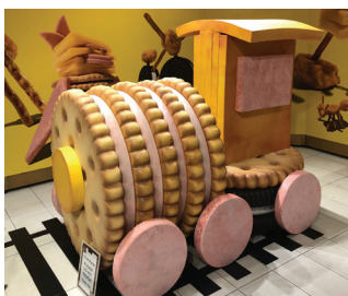
Interactive Exhibits & Props