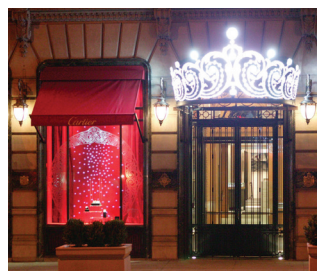
Event-Based & Seasonal Marketing