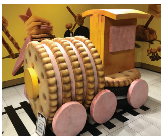
Interactive Exhibits & Props