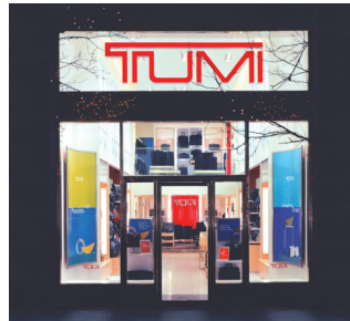
Storefront & Exterior