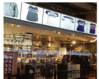
Digital & Technology