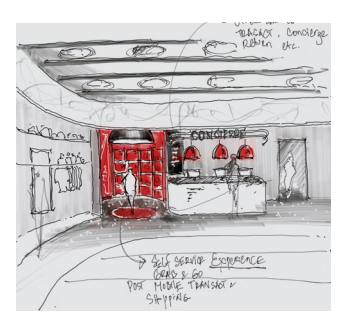
Retail Design & Development