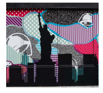
Large Format Printing