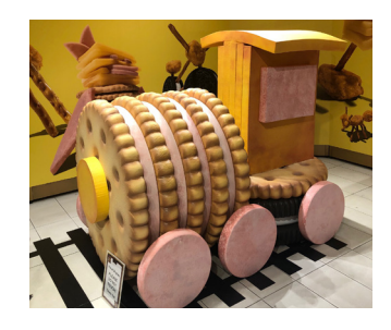
Interactive Exhibits & Props