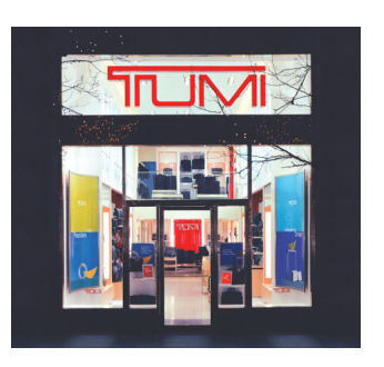
Storefront & Exterior