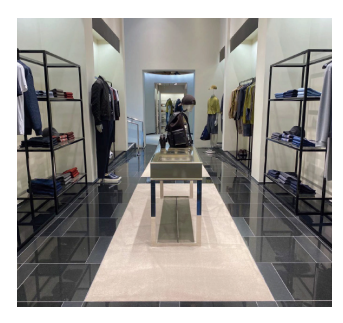
Shop-in-Shop & Fixtures