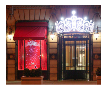
Event-Based & Seasonal Marketing