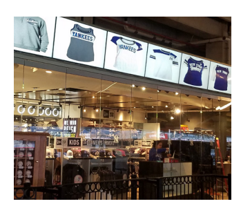
Digital & Technology